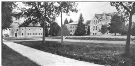
WASHBURN COLLEGE, TOPEKA.

The drought of 1860 and the breaking out of the Civil war caused the collapse of this enterprise. In 1860 the institution was moved back to Topeka on a proposition practically the same as that first given by the citizens of that city. In 1861 at the meeting of the association in Leavenworth the subject was further discussed. At Burlingame in May, 1863, resolutions were passed appointing trustees to start the academy at Topeka as soon as they deemed it wise, and in Feb., 1865, the institution was incorporated under the name and style, "Trustees of Lincoln College."